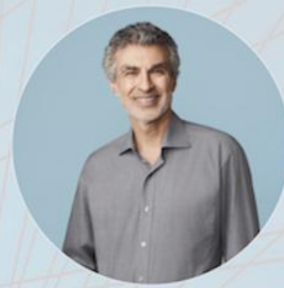
Yoshua Bengio Université de Montréal